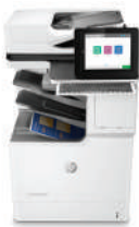
HP Color LaserJet Managed Flow MFP E67560z

HP Managed MFPs are optimized for managed environments. Offering increased monthly page volumes and fewer interventions, this product can help reduce printing and copying costs. See your HP Authorized Reseller for details.